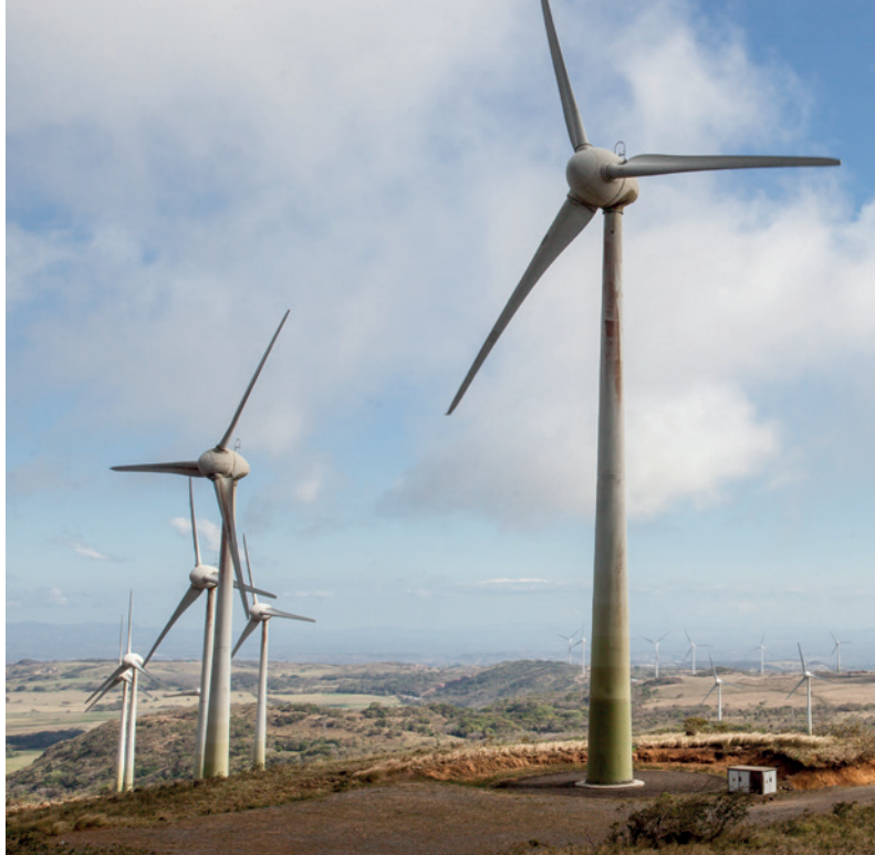
► Guanacaste wind park Costa Rica